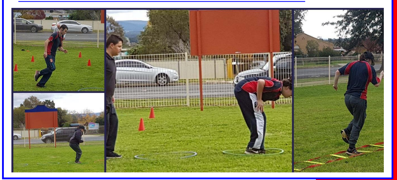
Be Respectful, Be Responsible, Be Safe